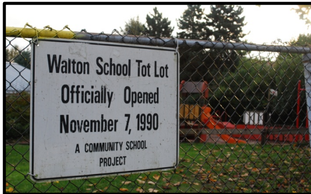
Original Walton Tot Lot Opened November 7, 1990. The Tot Lot is 24 years old this week!

Walton PAC is actively seeking additional donors and grants and focusing our many fundraising efforts to help build this beautiful new playground.